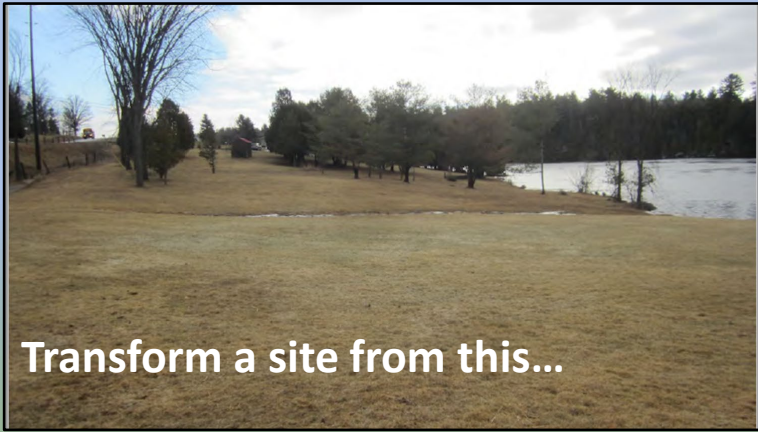
Transform a site from this...